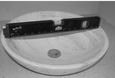
Above: Process for "Recessed Mounting"

Remove the nut attached to the threaded pipe of the drain and place the drain assembly along with the upper most rubber drain gasket (if provided) into the sink's drain hole.