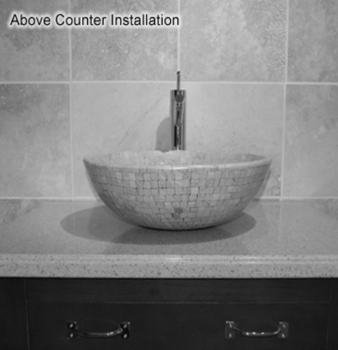
Above Counter Installation