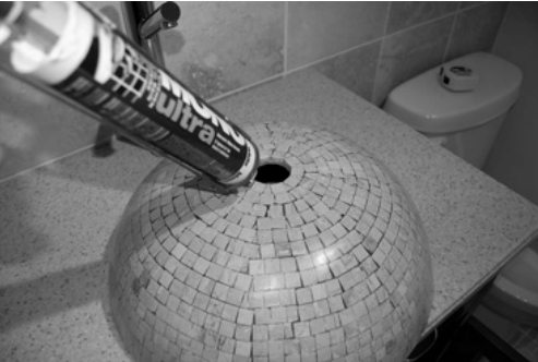
Above: Process for "Above Counter Mounting"