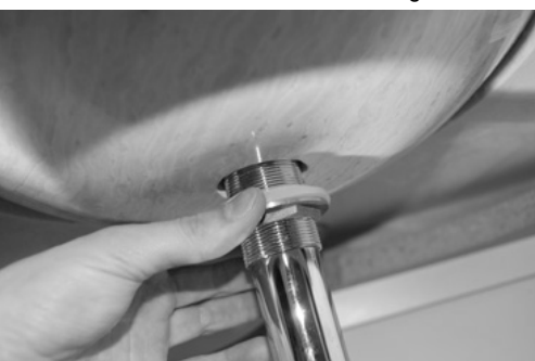
Above: Drain Attachment

Remove the nut attached to the threaded pipe of the drain and place the drain assembly along with the upper most rubber drain gasket (if provided) into the sink's drain hole.